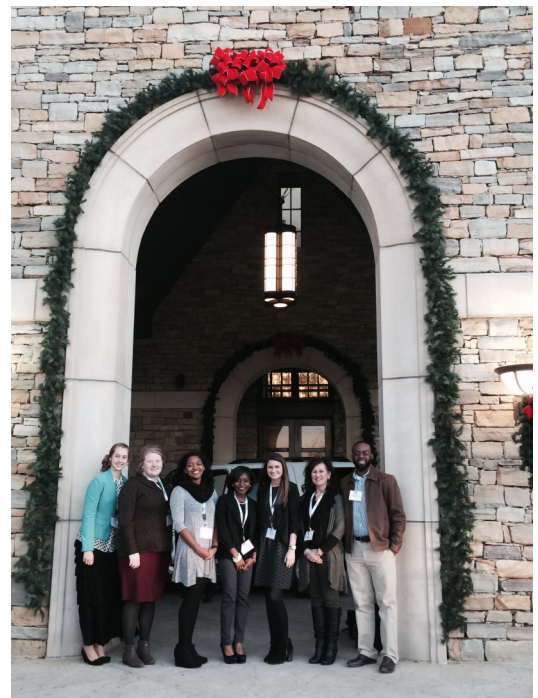
Students from Louisiana Tech University enjoyed GC3