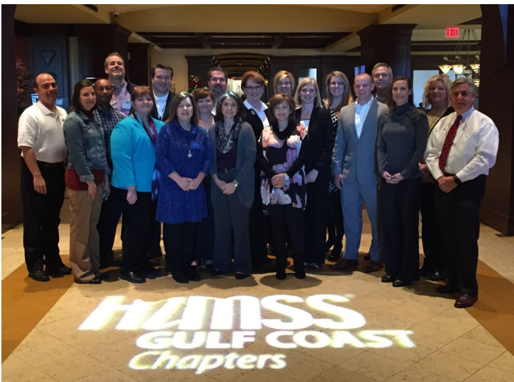
GC3 Planning Committee & Volunteers

The GC3 conference was held at the beautiful Ross Bridge Golf Resort and Spa in Birmingham, Alabama. Over two hundred attended the event along with 28 sponsors. The conference was organized by volunteers from the HIMSS chapters of Louisiana, Mississippi and Alabama. Please join us in 2016 as we continue to improve upon this very successful venture of the Gulf Coast chapters!