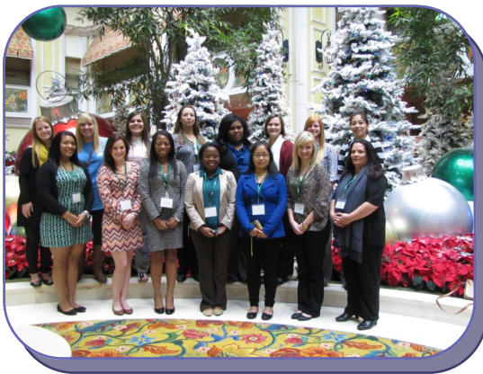
Students from Louisiana Tech University