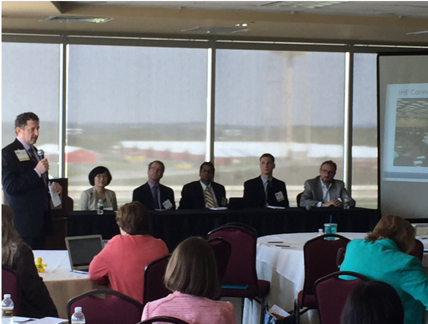
Triple Aim Event — Expert Discussion Panel